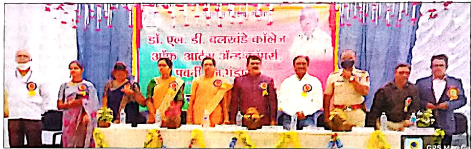
Guests present at the programme.